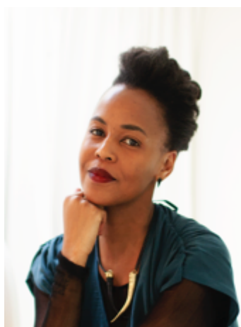
Wangechi Mutu

21st Annual Gala Celebration Will Take Place July 20, 2017 Event To Feature Unique Installation by Snarkitecture