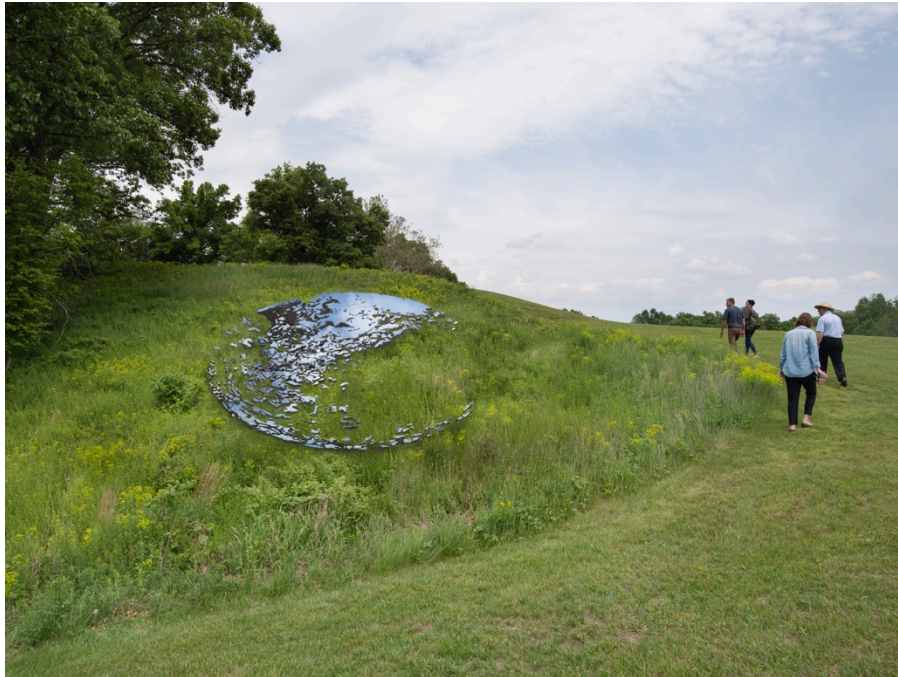
Rendering of Fallen Sky by Sarah Sze © Sarah Sze; Courtesy of Storm King Art Center

Titled Fallen Sky , the New Sculpture Will Be Installed in 2020