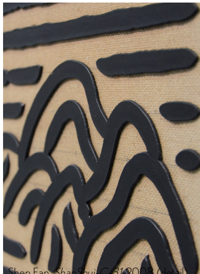
Shen Fan, Shan Shui (C 31, 2008) (detail), Oil on canvas, 54 3/8 x 27 1/8 inches (138 x 69 cm), Courtesy of Shen Fan, ShangHART Gallery and Eli Klein Gallery

Contemporary art in China was mostly dominated by Social Realism until it experienced a profound shift in 1978 with Deng Xiaoping's establishment of a new Open Door policy for the country. With the sudden availability of Western art publications, many artists began to adopt the Western style as a new mode of creating art, yet Shen rooted his work in Eastern philosophy in his pursuit of modernity. Whereas Western Abstract Expressionism is often associated with action painting and direct, energetic brushstrokes, Shen, in his 1992 and 1993 oil on paper works, indirectly imprint oil through the gesture of rubbing—a technique that has been practiced in China for thousands of years—symbolizing Confucian values of order and moderation and other Eastern philosophical principles.