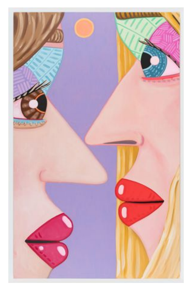
Brian Calvin, Distant Ships , 2019 - Acrylic on canvas - 284.5 X 177.8 cm, 112 X 70 in