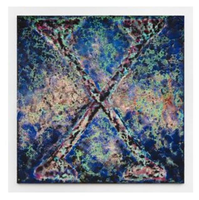
Vaughn Spann, Cosmic Symbiote (Marked Man), 2019 - Polymer paint, mixed media on aluminum stretcher bars - 213.4 x 213.7 x 4.4 cm, 84 x 84 1/8 x 1 3/4 in / @ Vaughn