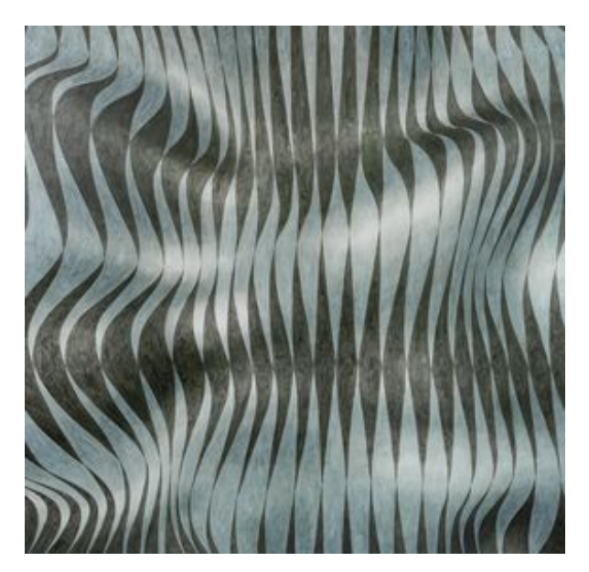
Peter Schuyff, Untitled , 2019 - Oil on linen - 150 x 150 cm, 59 1/8 x 59 1/8 in / © Peter Schuyff - Courtesy of the Artist and Almine Rech

Peter Saul / January 18 - February 29 Sally Saul / January 18 - February 29 Allen Jones / March 7 - April 11 Wes Lang / April 18 - June 6 Günther Förg / June 12 - July 25