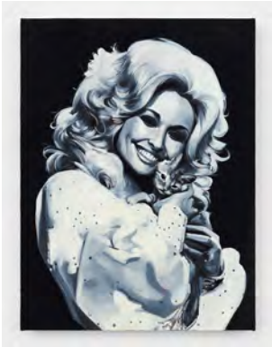
Sam McKinniss, Dolly Parton with kitten , 2021 - Oil on linen - 61 x 45.7 cm, 24 x 18 in / © Sam McKinniss - Courtesy of the Artist and Almine Rech - Photo: Dan Bradica.

Almine Rech London presents a solo exhibition of new paintings by American artist Sam McKinniss. Titled Country Western , this is McKinniss's second solo show with Almine Rech, following Neverland , presented in Brussels in 2019.