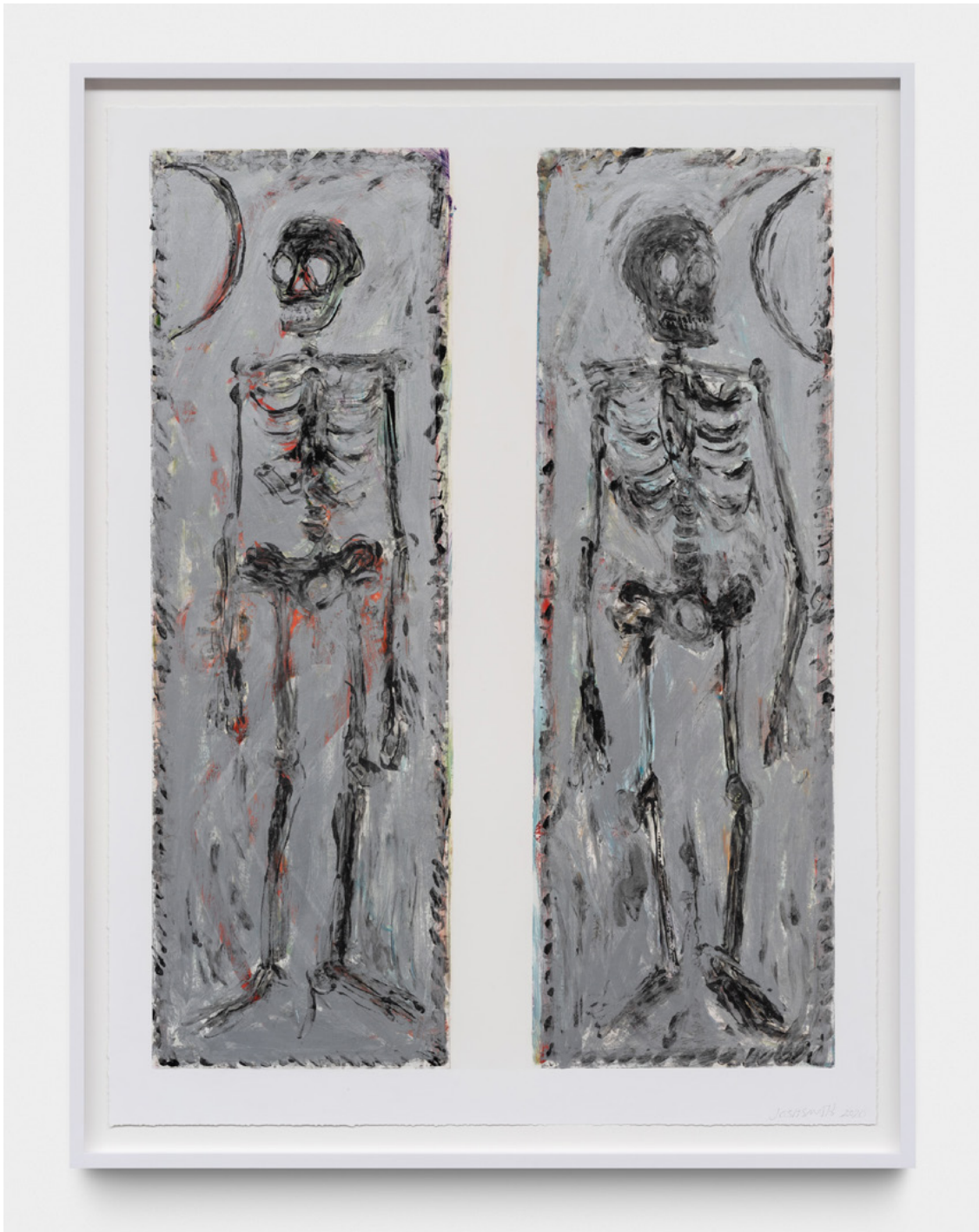
Untitled, 2020 monotype on Plike paper 93.3 × 69.8 cm, 36 3 / 4 × 27 1 / 2 in.

Courtesy the Artist and Xavier Hufkens, Brussels photo credit: HV-studio