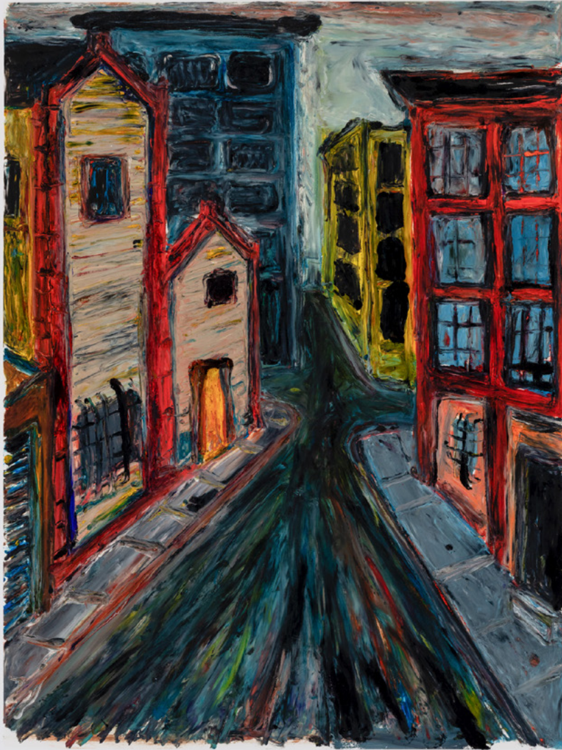
Untitled, 2020 monotype on Plike paper 88.9 × 67 cm, 35 × 26 3 / 8 in.