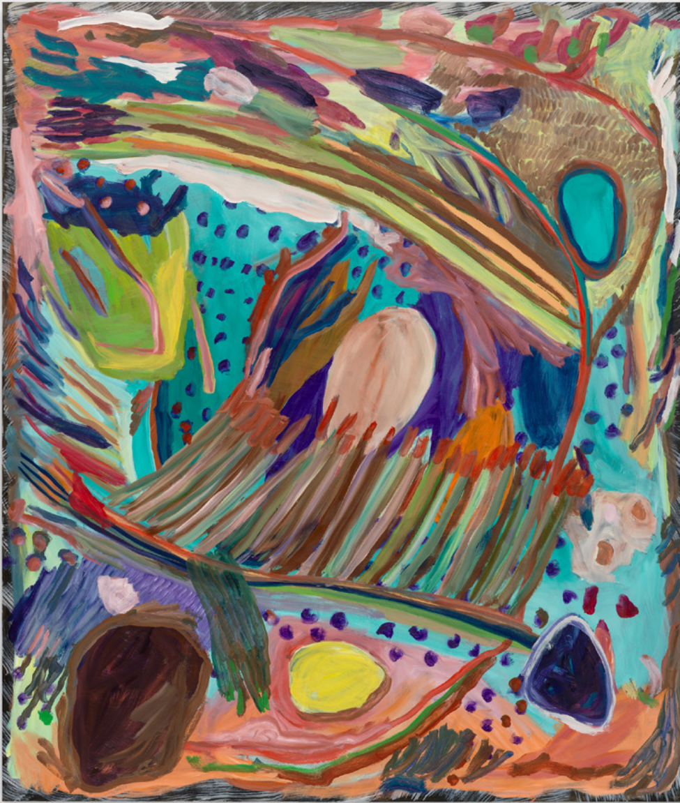
Spiritual Growth, 2022 oil on poly cotton 213.4 × 182.9 cm, 84 × 72 in.

Courtesy the Artist and Xavier Hufkens, Brussels photo credit: Kerry McFate