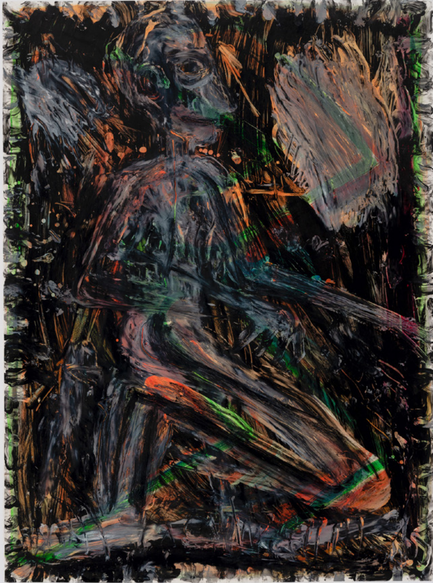
Untitled, 2020 monotype on Plike paper 88.9 × 67.3 cm, 35 × 26 ½ in.

Courtesy the Artist and Xavier Hufkens, Brussels photo credit: HV-studio