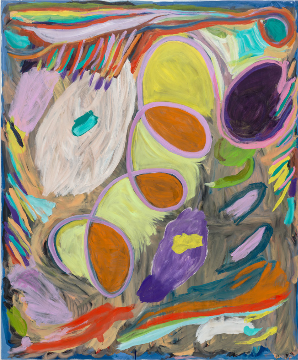
Mystery of Love , 2022 oil on poly cotton 182.9 × 152.4 cm, 72 × 60 in.