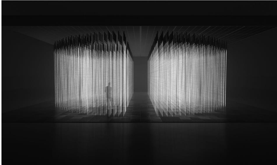
Random International, Living Room , 2022. Render of immersive light-installation. Commissioned by Aorist in partnership with Faena Art.

On the occasion of Miami Art Week 2022, Faena Art brings Quayola's Effets de Soir to the Faena Art Project Room , Faena Art's dedicated space in Miami Beach for artistic experimentation and the development of innovative ideas. Presented in partnership with Aorist – a next-generation cultural institution supporting artists creating at the edge of art and technology – Effets de Soir is a video-based series that explores a new form of digitalized Impressionism, offering a distorted reality of the natural world. The title references the natural phenomena visible at dusk and dawn, when lights and shadows, warm and cold tones, fade into one another. The painting-like video is created through digital manipulation of ultra-high-resolution photographs of flowers from the lush gardens of Chateau de Chaumont-sur-Loire, a 10th-century French Castle, shot at night under artificial spotlights. Quayola uses these images to create a computational artwork that experiments with evolving compositions and rhythms.