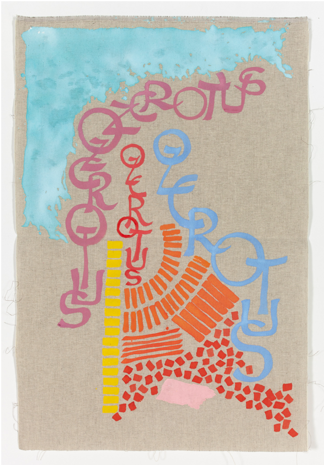
Ozcrotus , 2019 acrylic on canvas (pattina) 101 × 68 cm, 39 3 / 4 × 26 3 / 4 in.