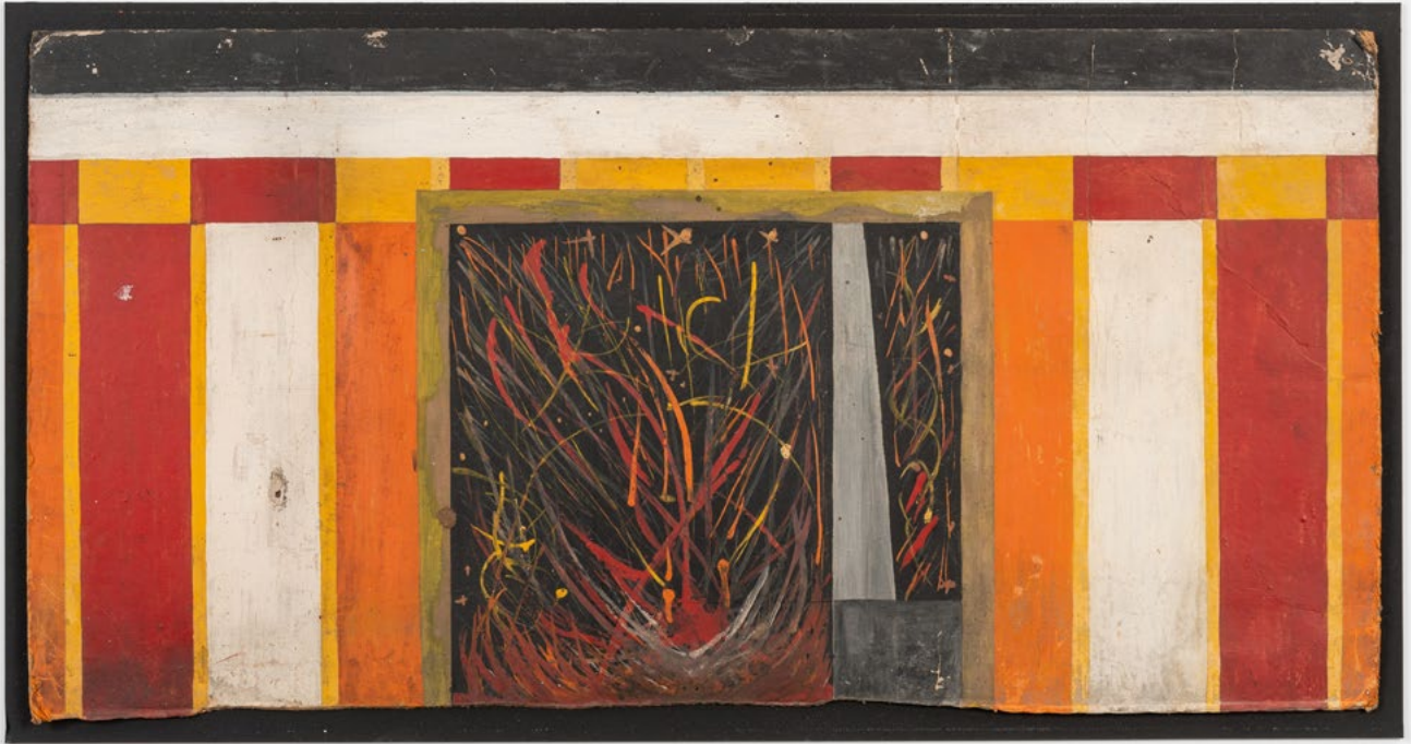
Untitled (Firecrackers from the Balcony) , n.d. oil on cardstock 27 × 53 cm, 10 5 / 8 × 20 7 / 8 in.