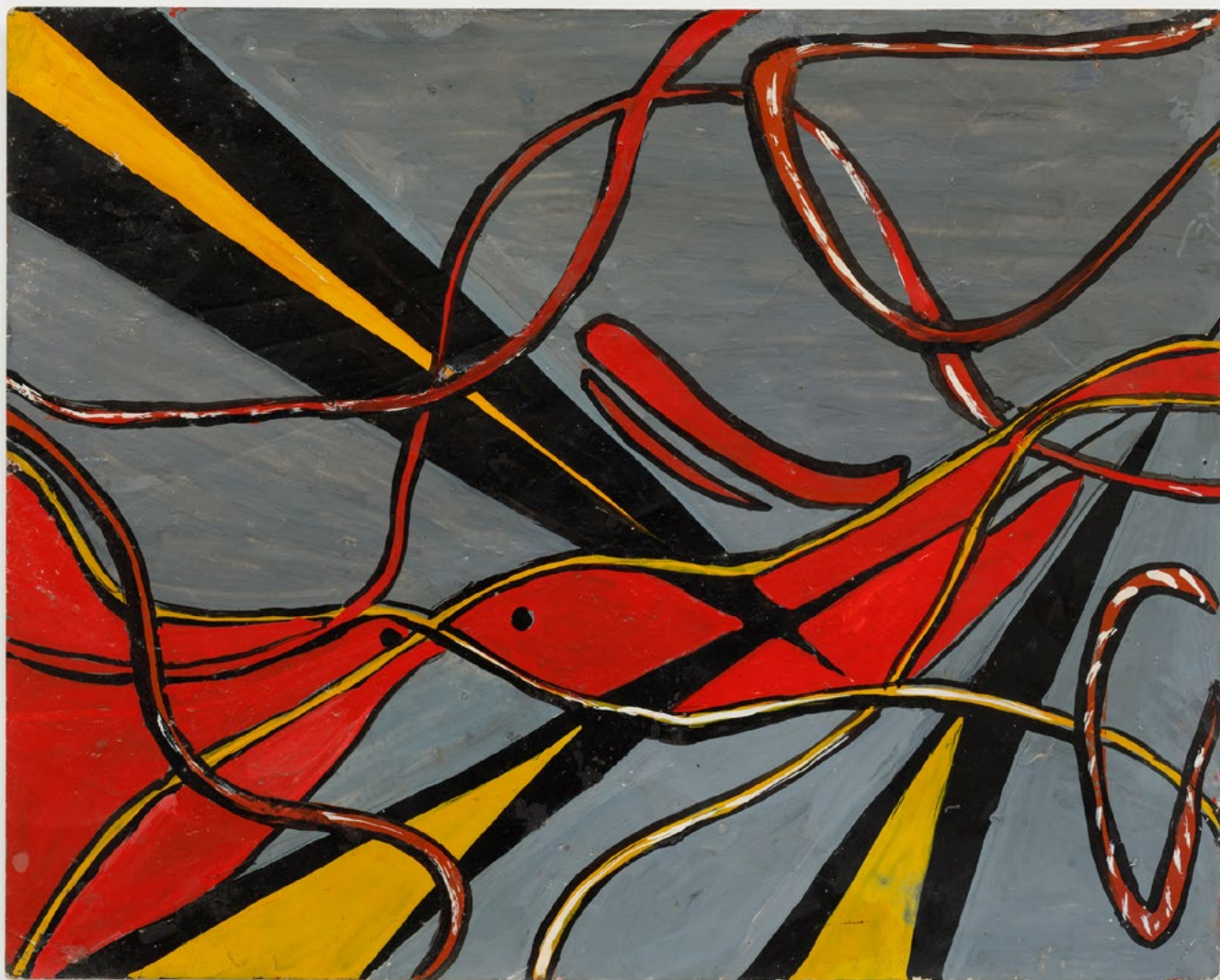
Abstract Red Birds , n.d. oil on photograph with silver emulsion 20.2 × 25.2 cm, 8 × 9 7/8 in.