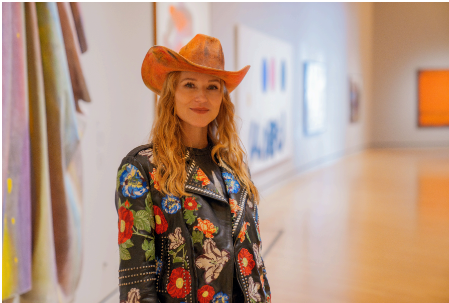
Jewel pictured with ‘Mazda’ by Sam Gilliam in the Contemporary Gallery at Crystal Bridges Museum of American Art, January 3, 2024.

“The Portal: An Art Experience by Jewel” melds art, technology, and wellness